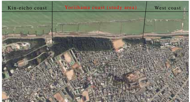
Figure 1 Present conditions of study area

In this study, a "draft Yoriihama seacoast use plan" was first developed based on the "draft Yoriihama use plan (provisional policy)" (Figure 2) prepared as a result of a fiscal 2004 study while building a consensus with local residents. Then, for developing and implementing plans for facilities improvement in the Yoriihama area, sessions were held for exchanging views and questionnaire surveys were conducted. The goal was to build residents' organizations based on the consensus built through public involvement.